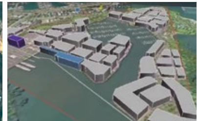
Toondah Harbour 'Master Plan'.