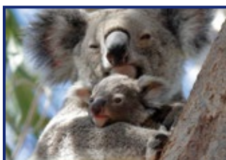
Toondah Koalas won't survive the plan.

Most of Redland City's drinking water is sourced from North Stradbroke. The Island's aquifer and dependent wetlands could be adversely impacted by taking large quantities of additional water to service this gross over-development.