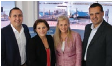
Jackie Trad pictured at Toondah Harbour when announcing Labor's decision to continue with the irresponsible plan to dredge and 'reclaim' Ramsar protected wetlands for high-rise apartments