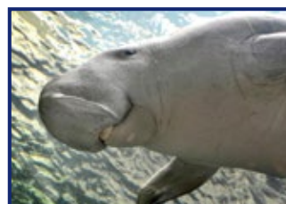
Threatened Moreton Bay dugongs inhabit the area