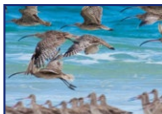
Critically endangered Far Eastern Curlews