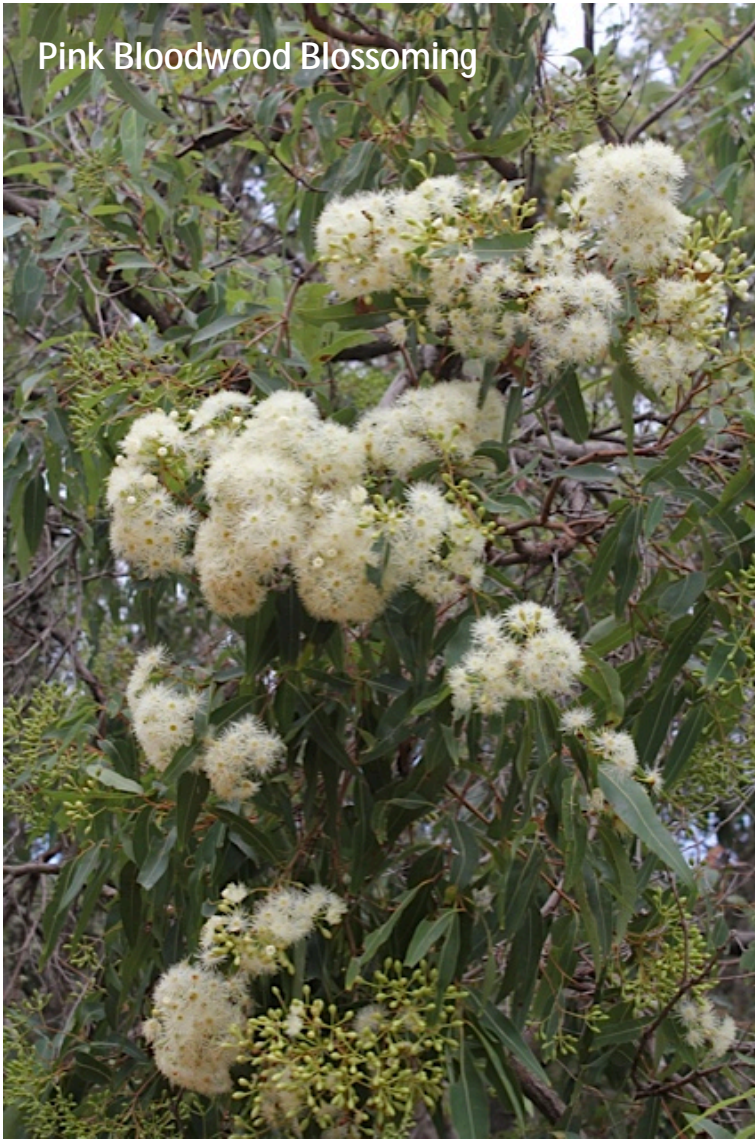
Pink Bloodwood Blossoming