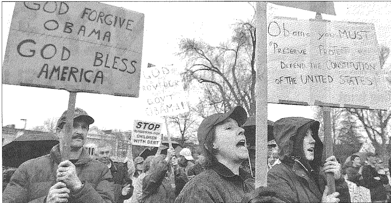
CRITICS INFLAMED: Protesters ahead of Barack Obama's appearance in Iowa to talk about health care.

US liberals call the phenomenon Obama Derangement Syndrome - a pathological