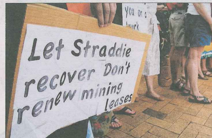
LONG FIGHT: One mine will continue to operate until 2027.

I AM fed up with all the muck-slinging that accompanies every election. Six people are standing as candidates for Bowman. They expect votes but only one has