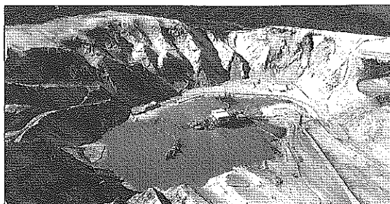
GOOD AS GOLD: Sand mining on North Stradbroke Island is lucrative, but carries heavy penalties for illegal sand extractions.

In August, The Courier-Mail revealed the company had been issued with "show cause" notices following "detailed investigations" by the Department of Environment and Natural