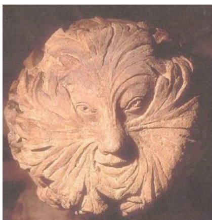
The Green Man at Notre Dame, Paris