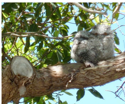
Tawny Frogmouth babies – too cute for words!