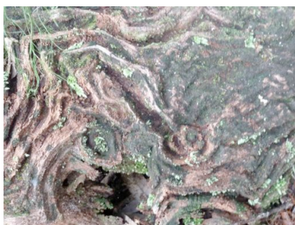
The Green Man at Straddie