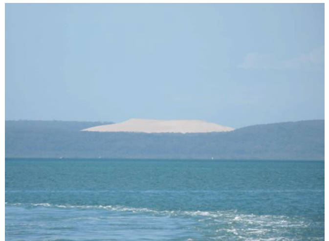
View from the ferry

The government has portrayed itself as protecting Straddie's environment. Prior to the High Court decision it may have convinced some people that allowing destructive sand mining to continue for another 14 years was reasonable when measured against a 100+ year mining related future, deceptively referred to by the Bligh government in various attempts in the media and parliament to justify its actions. But now that the High Court has finally stripped that future away, the real measuring stick becomes Fraser Island. In 1976, sand mining was stopped on Fraser in just 6 weeks, despite the same scaremongering about economic doom as we have seen from Sibelco. No one regrets ending mining on Fraser Island. It's Stradbroke's turn to be protected in fact, rather than fiction.