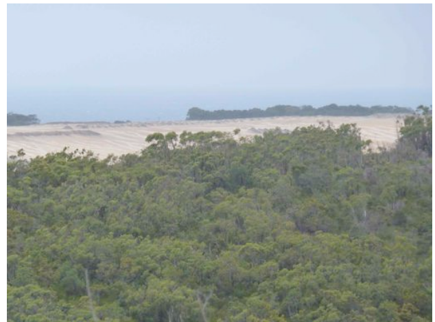
Mining advancing into the bushland