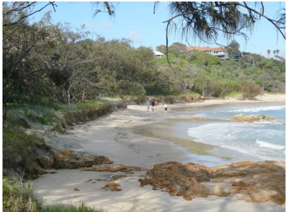
Deadman's Beach at its worst

There is no such plan for the Point but Councillor Craig Ogilvie says "Council is doing some updated modelling on sea level rises and how that might impact on the coastline."