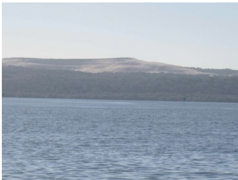
Sand heaps now need revegetation

All this impact on safety and peace of islanders and tourists was for the sake of ten jobs! (This figure was contained in the company's application for planning permission to the Redland City Council)