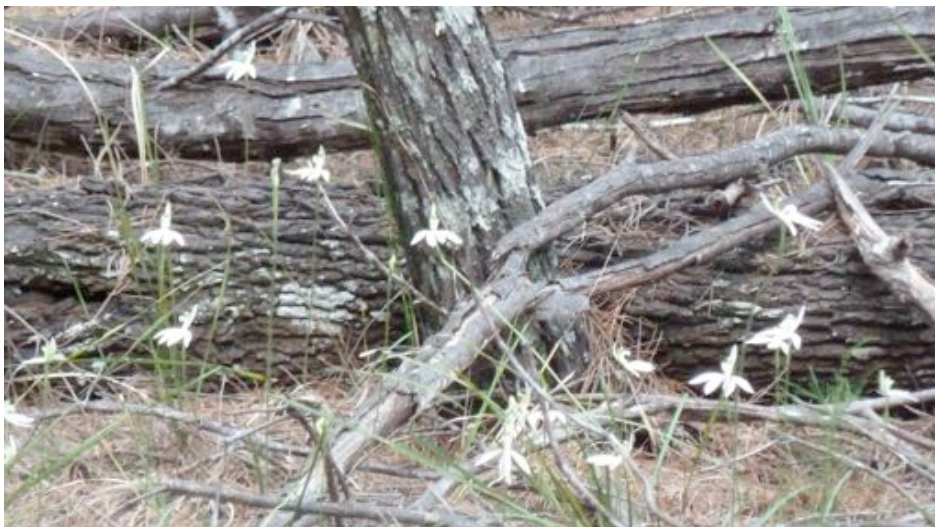
Orchids blooming for winter - White Caladenia, Caladenia catenata

The company was charged in December 2009 with three summary offences alleging it did not have permits authorising it to remove and sell large quantities of non-mineral sand for landscaping and other purposes. The Court of Appeal has already confirmed that the actions were unlawful. However the company's criminal responsibility has not been determined. Last month Unimin/Sibelco was back in the Brisbane Magistrates court for 2 days, this time arguing that the prosecution against it is an abuse of process. The argument continues on November 7, with 3 more days set aside. It will then be almost 3 years since evidence was seized in a raid on Unimin's premises by the defunct EPA and two years since the charges were laid, an unusual delay in the initial hearing of summary charges in the Magistrates Court. Meanwhile, the government still refuses to send all of the evidence to the DPP for assessment of more serious charges, despite senior counsel opinion that there is a prima facie case of stealing and fraud against the miner.