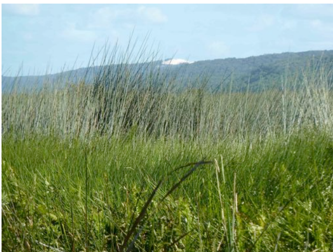
Enterprise mine encroaching on swamp

Since 1988 the Centre for Coastal Management at the Southern Cross University has been conducting ongoing biological monitoring of 18 Mile Swamp for the RCC. In 2002 this included aquatic invertebrates, frogs and birds. New species of invertebrates and other forms of life were discovered that were not found on the mainland. Some life forms depend entirely on the existence of freshwater for feeding, living or breeding. If changes occur in the swamp the following could be endangered: the Oxleyean Pygmy Perch Nannoperca oxleyana , Water Mouse Xeromys myoides , 5 plant species including the Yellow Swamp Orchid Phaius bernaysii , the Swamp daisy Olearis hygrophila , and the Wallum froglet Crinia signifera , the little acid loving frogs that are dependent upon the reeds for their existence. The wetlands are feeding and resting grounds for many species of local and migratory birds.