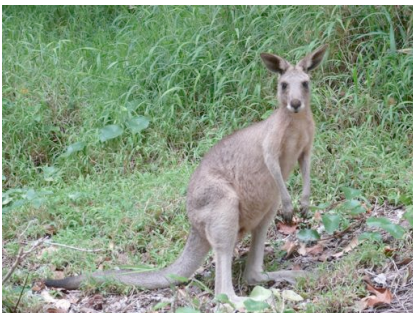
Lawn Grazing Grey Kangaroo

Council figures on the major part tourism plays in the Stradbroke economy reveal that visitors to holiday houses have an expenditure on Stradbroke per year of at least $ 20 million. With rentals down due to the weather and the economy it's no wonder island businesses are reporting lower takings.