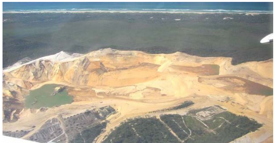
Let's stop mining before more of our island is gouged out. . . North Stradbroke Island mining operations from the air.

In 1990, the Goss Labor Government considered it appropriate that at least 50 per cent of North Stradbroke Island be declared national park. It did not happen. Less than 2% of the Island around Blue Lake - national park since the 1960's - is protected. Over half of the Island is under mining lease, with the public excluded under threat of prosecution and mining destroying a valuable natural asset.