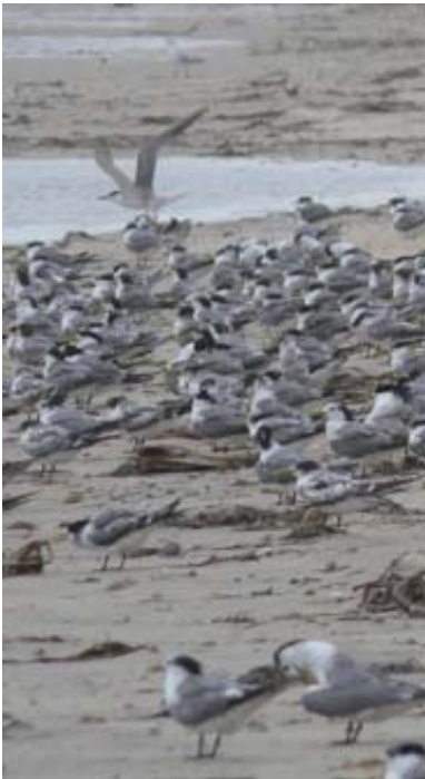
Silver terns on Frenchman's Beach during the recent wet weather.