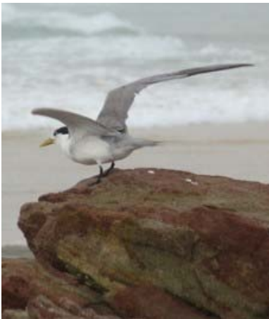
Into the storm. . . A crested tern on Deadman's Beach (above).