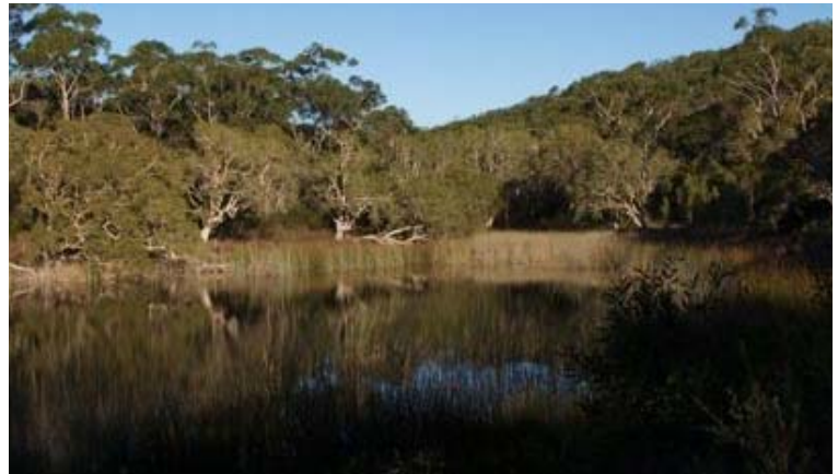
Off limits ... mining leases restrict public access to places like this.

traditional lands, as has occurred with national parks in the Northern Territory and north Queensland.