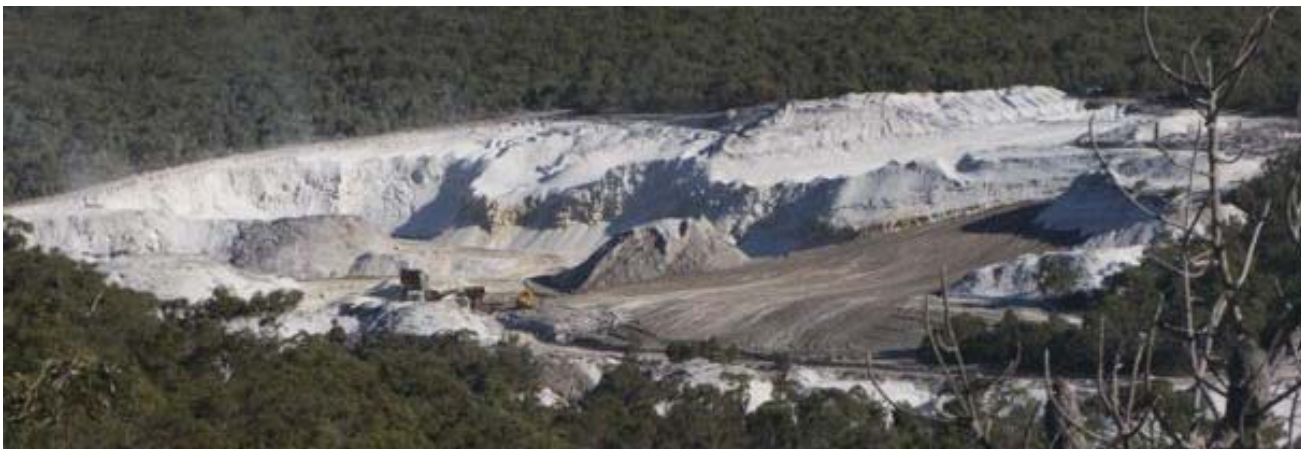
Unimin in court . . . Unimin's NSI operations (above) were under scrutiny when the miner faced court on illegal mining charges. People gathered at the Cleveland Court House in force to protest against mining on the island (top).