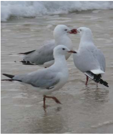
Beach breakfast. . . silver gulls fight for a morsel on Frenchman's Beach (above).