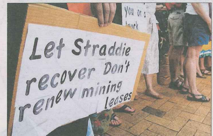
LONG FIGHT: One mine will continue to operate until 2027.

I AM fed up with all the muck-slurping that accompanies every election. Six people are standing as candidates for Bowman. They expect votes but only one has